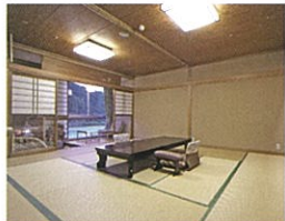
Japanese Suite Room with fine view bath (river side)