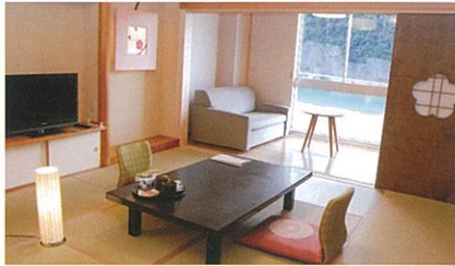
Modern-type Japanese Room