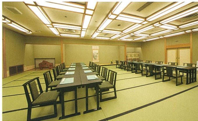
Small Tatami Room (with chair and table)