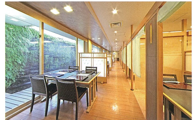
Kissho (Japanese Restaurant)