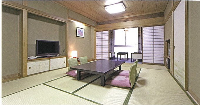
Standard Japanese Room