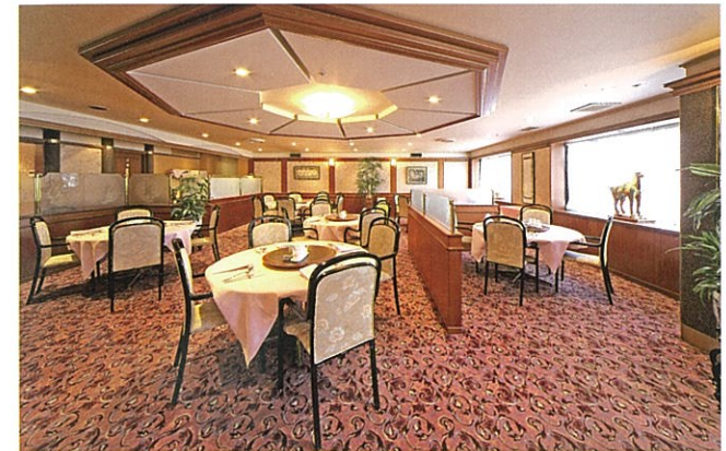
Kasen (Chinese Restaurant)