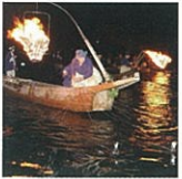
Cormorant Fishing (Ukai) on the Nagaragawa River