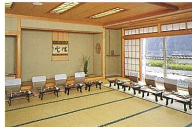
Small Tatami Room