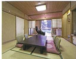
Japanese Room with fine view bath (river side)