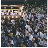
Gujo Hachiman "Gujo Odori"