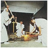
Seki Sword Forging