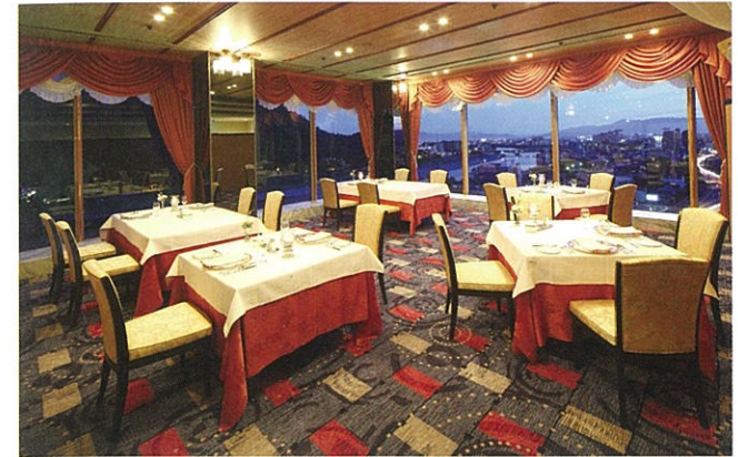
Castle (French Restaurant)