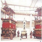
Takayama (Yatai Kaikan)